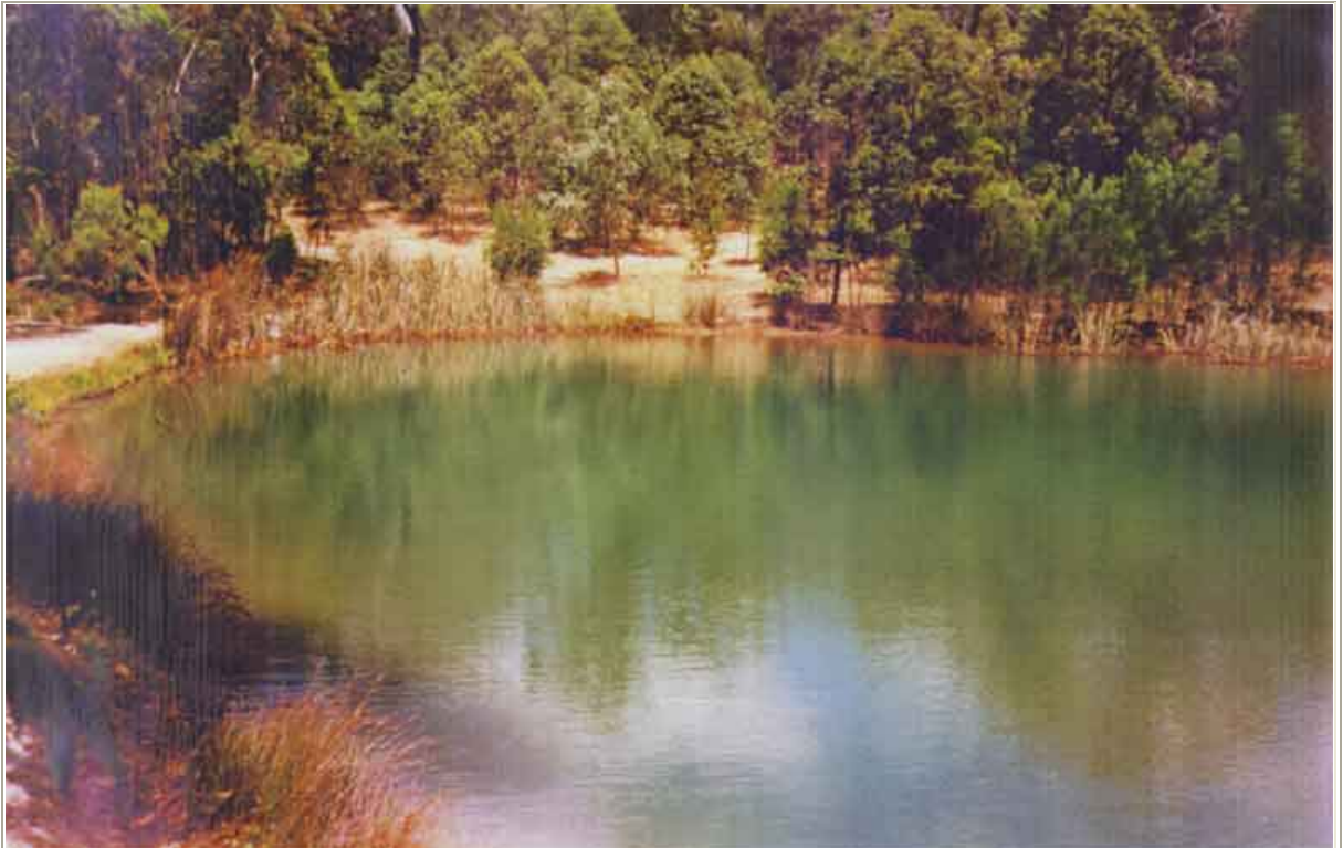
Top Dam Looking East